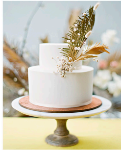
Two cakes were served: one traditional, shown here with a dried-palm accent; the other to celebrate a close friend's birthday, on the same day.