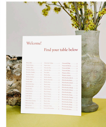
A simply designed seating chart led guests to family-style tables at the reception venue.

“ The reception felt like a giant hug from all our friends—that's actually how we felt the whole day. —KAE ”